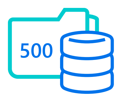
high-value data sets posted on the Texas Open Data Portal.<sup>2a</sup>

Agencies should proactively identify open data and make it available to Texans through easily accessible sources that empower the public to be more engaged with state government.