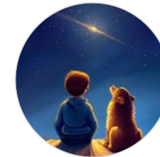
New images by Dall-E2, Stable Fusion, etc.