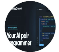
New code using GitHub Copilot